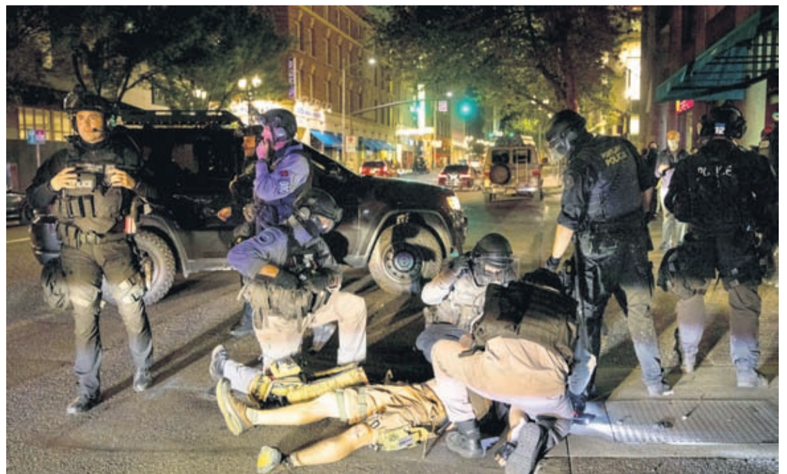
A man is treated after being shot Saturday, Aug. 29, 2020, in Portland, Ore.

"Let's work together. Wouldn't that be a message? Donald Trump and Ted Wheeler working together to help move this country forward."